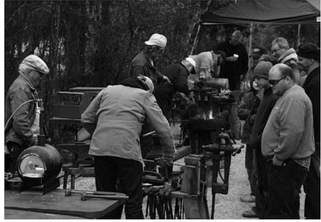
The January weather was chilly, but it didn't stop this dedicated crowd from enjoying Forge Day's second year!