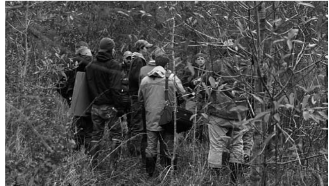
In January, graduate students from MSU Department of Landscape Architecture discussed plans for the site inventory of the Gum Pond Exhibit.