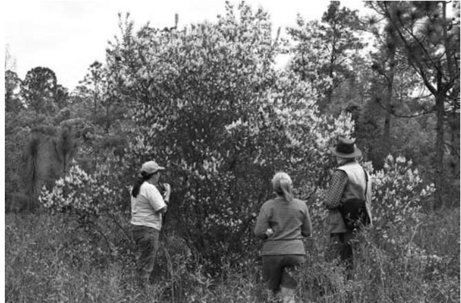
Native plant enthusiasts examine Cliftonia in peak bloom during an April field trip to Hillside Bog, a final treat in a great day of native plant walks and programs that were sponsored by the Mississippi Native Plant Society.

Reservations: Call the Arboretum office at (601) 799-2311, to confirm all events and to make program reservations, as seating is limited. Programs are subject to change. Physical Address: 370 Ridge Road, Picayune, MS 39466 Mailing Address: P.O. Box 1639, Picayune, MS 39466 E-mail Contact: drackett@ext.msstate.edu Hours of Operation: Wednesday-Sunday, 9:00 a.m.-5:00 p.m. 2010 Admission Fees: Adults, $5; Seniors (over 55), $4; Children under 12, $2; Members, free admission to grounds and programs. Webpage: www.crosbyarboretum.msstate.edu . Lists programs and events, volunteer opportunities, Arboretum and Natural Area information, and news updates.