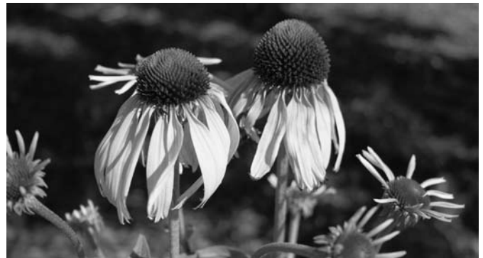
Coneflowers "steal the show" with their long bloom season, drought-tolerance, and wide range of colors.

Though named for the color purple, breeders are selecting varieties with white, orange, yellow, red and almost every color in between. Summer Sky is one of the varieties with an outstanding new color. This bi-color coneflower has soft peach petals and a rose halo around the cone. The flowers are 5 inches in diameter and very fragrant. It is a good cut flower choice. Another new variety with outstanding color is Twilight, which has rose-colored petals surrounding a unique red cone. This is a heavily branched variety that is extra fragrant.