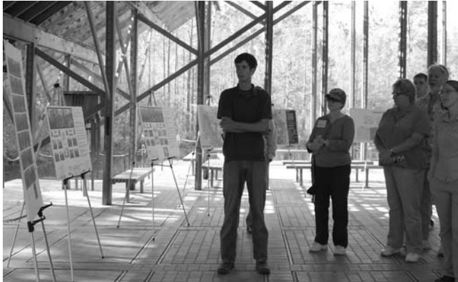
MSU graduate students from the Department of Landscape Architecture presented the results of their design charette for the Gum Pond Exhibit in March.