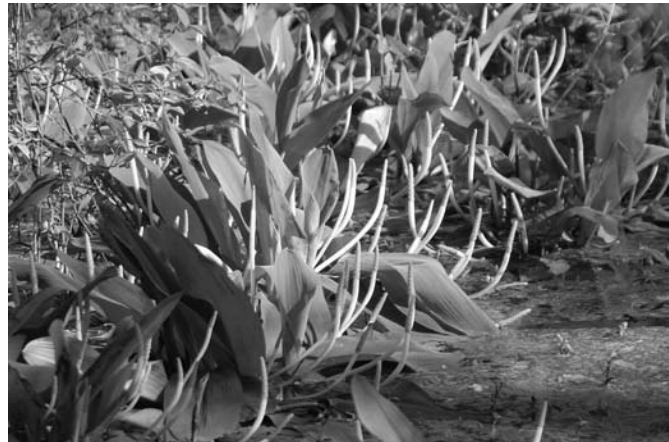
Golden club in full bloom.

Water-lilies are a classic for adding character to the water garden. The American white water-lily ( Nymphaea odorata ) has fragrant white flowers with yellow centers that open in the morning and close in the afternoon. Flowers bloom in the spring and summer months. It grows well in full sun, part shade, or even shaded locations. This plant can grow in shallow spots with as little as 3 inches of water or in deeper areas that contain as much as 6 feet of water.