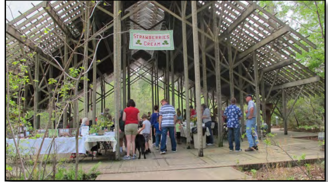
Over 160 guests attended the annual Strawberries & Cream Festival, Sunday April 7, 2013. The event is held in the Pinecote Pavilion.