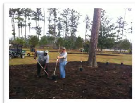
Planting yellow flowering magnolias in the Piney Woods Garden.

*See Dr. Owings at The Crosby Arboretum on Friday July 12!