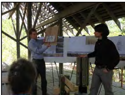
On April 6, MSU Architecture students presented their models and built samples for bridges proposed for the Gum Pond Exhibit. (Image by P. Drackett)

The Crosby Arboretum, MSU Extension Service