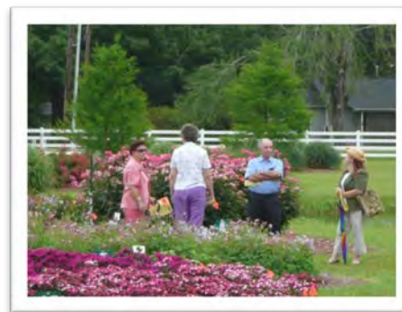
Sun Garden at Hammond Research Station.