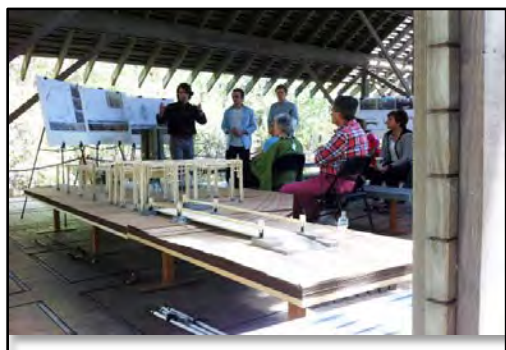
Spring 2013 Student Presentations

Following the design trajectory set in the spring, this semester's students choose to focus their efforts on the pedestrian bridges and weir structure adjacent to the Gum Pond. Guided by the necessity for stabilization of the water course and pond hydrology, the students set to work designing both the aesthetic details and construction methodology for the built elements.