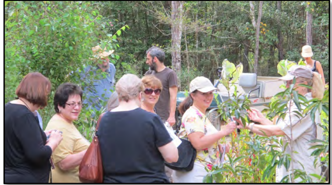
The annual Fall Native Plant Sale brought great crowds despite rain on Saturday.