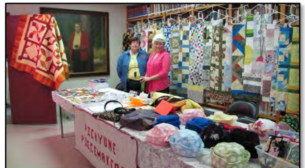
Come out and enjoy the two-day 11 th annual Piney Woods Heritage Festival, Nov. 15 & 16, 2013. Picayune Piecemakers featured above at the 2012 event.

Sign-up on our blog to receive email alerts when a new blog is posted? Join 43 other subscribers, today!