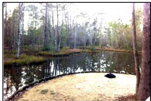
Gum Pond Exhibit Spring 2013.