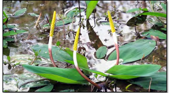
Orontium aquaticum, goldenclub, at the Arboretum.

Frequency of visitation to The Crosby Arboretum by survey respondents. Four choices were given as options: never, rarely (< once/year) annually (≥ once year), and many times per year. Respondents could only choose one answer.