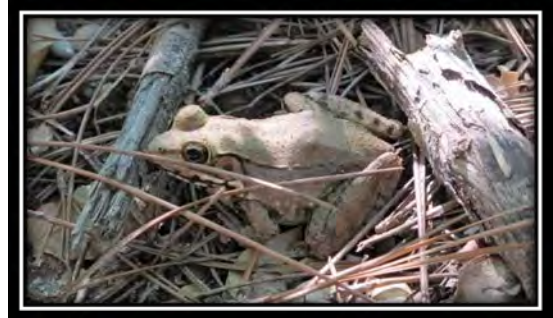
Vocal frog near the visitor center at The Crosby Arboretum.