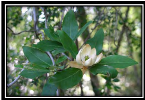
Sweetbay magnolia (Magnolia virginiana).

Louisiana Super Plants also shares a native with the Mississippi Medallion program - Henry's Garnet virginia sweetspire.