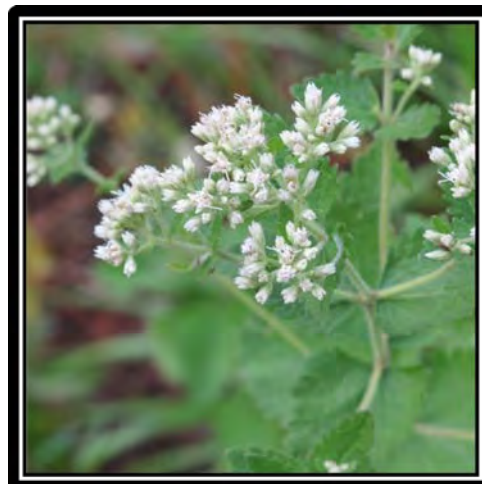
Eupatorium rotundifolium, roundleaf eupatorium, November 2011 at the Arboretum.