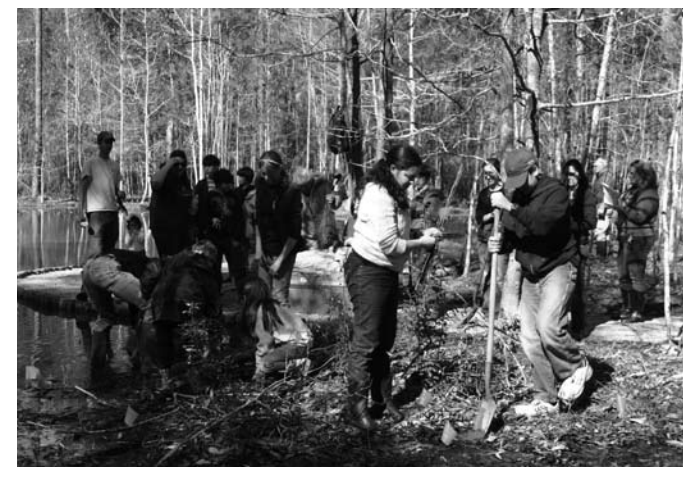
More than forty volunteers helped with the Gum Pond planting day on February 12 for Mississippi Arbor Day.

Please address correspondence to: Pat Drackett, Editor The Crosby Arboretum P.O. Box 1639 Picayune, MS 39466