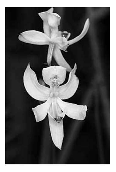
Mississippi native orchid, Calopogon pallidus. The genus name is Greek and means "beautiful beard."

Like many of the other orchid species in Mississippi, Epidendrum conopseum resists attempts to grow it outside its natural environment.