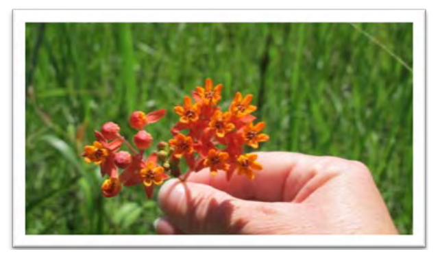
Asclepias lanceolata (fewflower milkweed) blooming April and May at the Arboretum.

tree, titi, black cherry and choke cherries light up the landscape with white flowers. Shrubs dot the woods with colorful blooms like our native orange flowered and wild azaleas that capture my breath every time I see them. The fragrance of crushed wax myrtle leaves are the strongest this time of year as new branches emerge. Star anise with its beautiful red star flowers also gives a wonderful fragrance from the leaves this time of year.