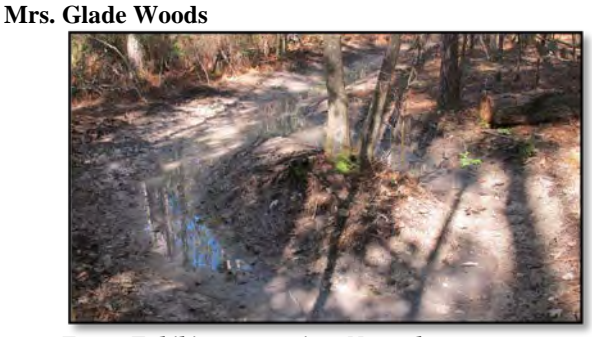
Swamp Forest Exhibit construction, November.