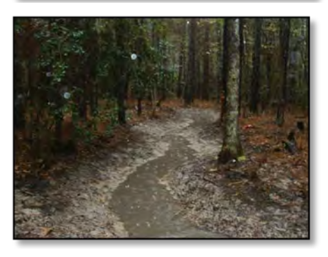
From the planning phase (top photo, MSU landscape architecture students), to the construction phase (center), and the exciting first rain event in November that tested the completed stream channel (top two images, Pat Drackett, bottom photo by Terry Johnson).