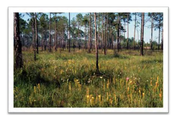
Spring bloom in south Mississippi flatwoods

There is so much to see when you take a walk outdoors this time of year. Trees such as flowering dogwood, buckwheat