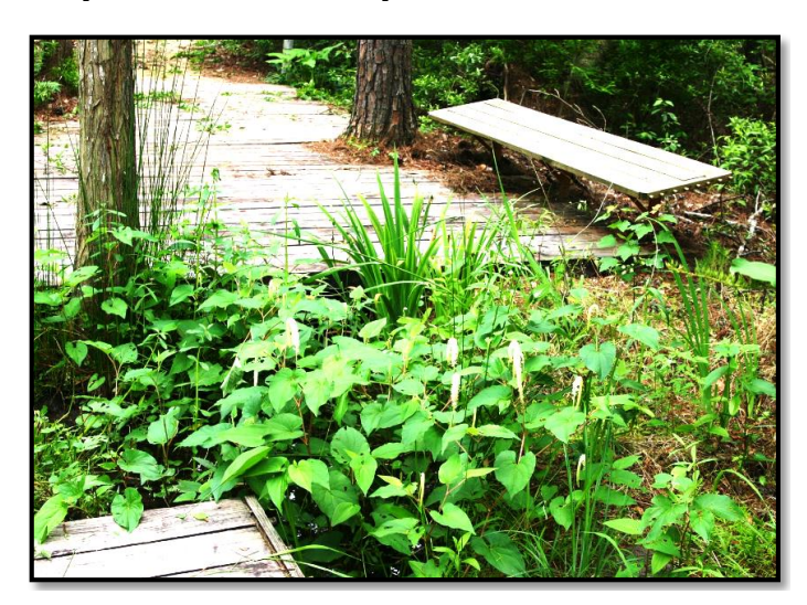
The new deck will contain seating, and will have a similar appearance to the existing Cypress Cove deck.