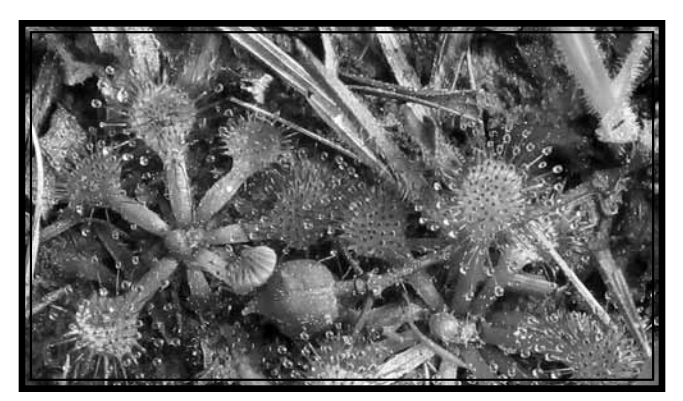
Drosera brevifolia, dwarf sundew.