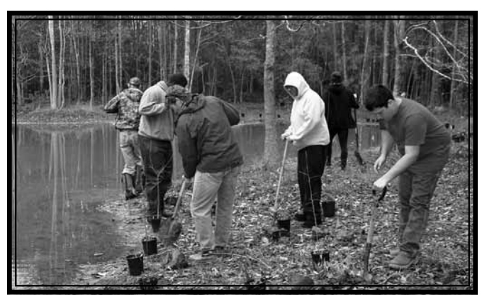
Students from Pass Christian High School volunteer planting trees at the Arboretum Gum Pond Exhibit, Arbor Day, February 2012.

The Crosby Arboretum will offer 2-hour programs for Girl Scouts of all ages working on environmental badges. Scouting groups may picnic before or after program times on the grounds as part of their visit. Program fees for Scouts and siblings is $8 per participant. Scout leaders and parent chaperones are free. Maximum number per group is 20 participants. All materials provided. Contact Girl Scouts of Greater MS to register at 228-864-7215 or register online at gsgms.org.