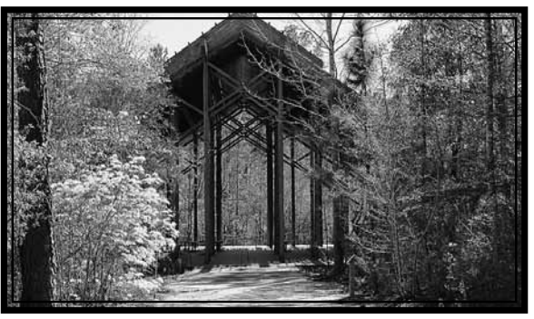
Rhododendron canescens, Piedmont azalea, in bloom near the Pinecote Pavilion, March 2012.