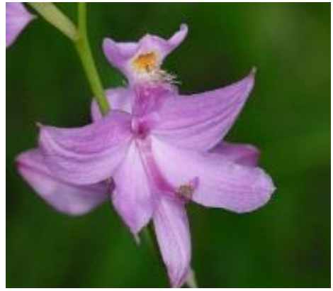
Grass pink orchid (Calogopon tuberosus)

Like most orchids adapted for temperate climates, the vast majority of orchid species native to Mississippi are terrestrial. Several of these are rare plants and are indicative of natural communities worthy of conservation efforts. Habitats range from old-growth deciduous forests in deep ravines in the northern part of the state, to fire-prone, grass-dominated savannas and carnivorous plant bogs, such as Dead Tiger Creek Savanna and Hillside Bog at the Crosby Arboretum, in southern Mississippi. Grass pinks (Calopogon spp.), ladies'tresses (Spiranthes spp.), and fringed orchids (Platanthera spp.), among other species, occur here in acidic, nitrogendeficient soils. Similar to many epiphytic orchids, these native terrestrial species like easy access to light. Historically, frequent lightning strikes in the mosaic of longleaf pine forests, savannas, and bogs in southern Mississippi started quickly-moving fires of low intensity that kept out many shade-producing, broad-leaved trees and shrubs. These fires would also help release soil nutrients, trigger seed germination, and stimulate blooming of pineland plants. Today, land managers must set prescribed, controlled burns to simulate these conditions. Without this practice, many plants and animals native to southern Mississippi would simply disappear. When properly managed, savannas can support 40+ plant species per square meter, making them the most diverse plant communities in all of North America outside the tropics!