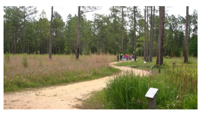
Interpretive signage along the Crosby Arboretum pathways allows for visiting school groups to self-tour at their own pace.

Growth and development of the arboretum should be slow and incremental. Also known as adaptive design, this tenet can prevent costly or irreversible planning mistakes. Before the Arboretum's Piney Woods Lake was excavated, the thensavanna wetland area was mown and studied for about a year. Adjustments to the pond edges and water depths were made to create the best shape even before the first dirt was shoveled. The same was done for pathways and buildings by testing an area before resources for construction were committed. The big orange kiosk sign that is located at the visitor entry is actually the proposed location for a future entry building. Our current temporary visitor's center is in the footprint of a