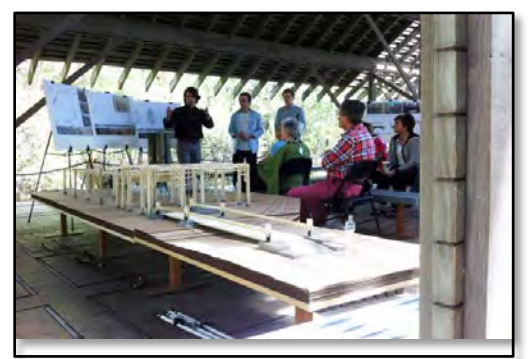
Spring 2013 Student Presentations (image by H. Herrmann)

Following the design trajectory set in the spring, this semester's students choose to focus their efforts on the pedestrian bridges and weir structure adjacent to the Gum Pond. Guided by the necessity for stabilization of the water course and pond hydrology, the students set to work designing both the aesthetic details and construction methodology for the built elements.