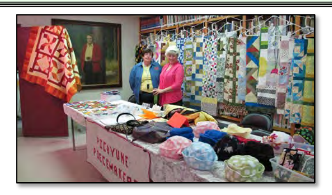
Come out and enjoy the two-day 11<sup>th</sup> annual Piney Woods Heritage Festival, Nov. 15 & 16, 2013. Picayune Piecemakers featured above at the 2012 event.

Sign-up on our blog to receive email alerts when a new blog is posted? Join 43 other subscribers, today!