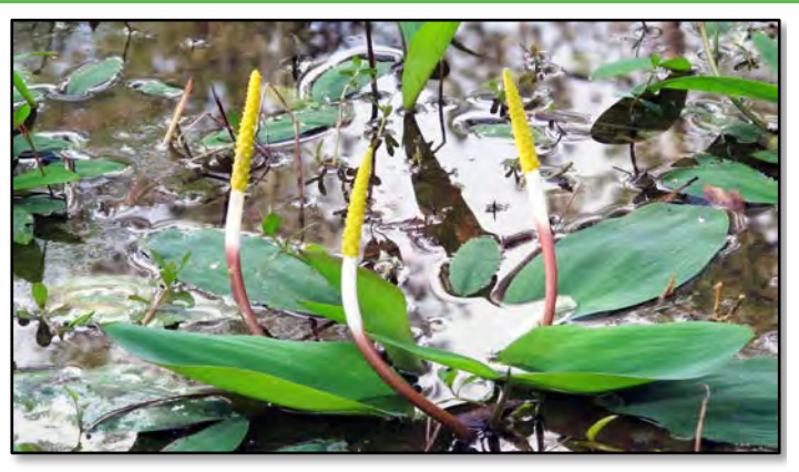
Orontium aquaticum, goldenclub, at the Arboretum.

For detailed information, and photographs for the above plants and other native plants found in our Exhibits, visit www.crosbyarboretum.msstate.edu to search the Crosby Arboretum Native Plant Database, hosted by the Lady Bird Johnson Wildflower Center (www.wildflower.org). A printable comprehensive plant species list for the Arboretum is also available.