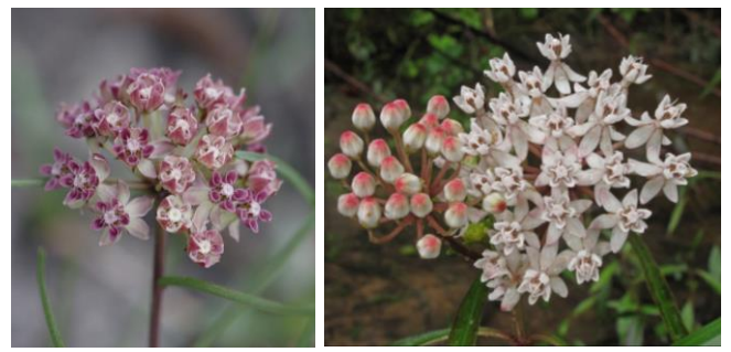
www. South eastern Flora. com

The process has been an enjoyable journey. Going from the point of only being acquainted with a few species in the genus Asclepias , it is a pleasure to have made the acquaintance of so many individual "personalities". Also of note is that the morphology of the milkweed flower has been compared in complexity to that of orchids. The flower pollination is a fascinating story – a pollinator's leg must pass through an