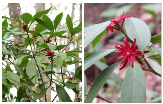
Above, Illicium floridanum growing in the mature beechmagnolia understory of Crosby Arboretum's Mill Creek Natural Area, located in northern Pearl River County.

Our natural landscape displays layers of plants throughout the region and one of these layers, the understory, offers a unique evergreen shrub called the Florida Anise ( Illicium floridanum ). The Florida Anise shows off dark green, lustrous leaves and when you brush past this plant in your garden it offers a strong aromatic smell. Found in the rich, mesic forests throughout southern Mississppi, Illicium floridanum can grow 8-12 feet tall and wide. Dainty flower buds begin to develop during the winter months and attractive dark red star shaped flowers begin to open in late winter and continue flowering into the spring. Try this native evergreen in your shade garden this year! Plant in partial to deep shade. The Crosby Arboretum has a small group of Illicium floridanum that has colonized to the south of the Visitor's Center (at the bottom of the south ramp). Come and explore native plants at the Arboretum this winter.