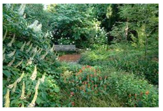
Garden image courtesy of Rick Darke.

intricacy of Wright's and Jones' designs complement the layered architecture of living landscapes. The observational ethic underlying their work heightens awareness of the continuous flux of biological systems and invites a celebration of subtle changes.