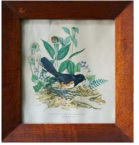
Towhee in Rick Darke's garden (top left); Framed towhee print (top right), courtesy of Rick Darke.