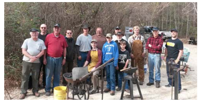
Forge Day 2015 brought local blacksmiths to the Arboretum who gave demonstrations to the public, teaching the traditional art of blacksmithing. Thank you for a great event!