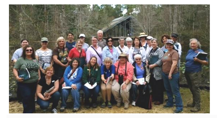
Thank you to all of the volunteers and community members who participated in the Nature's Notebook citizen science volunteer training held in February at the Crosby Arboretum!

Notebook is a national online program where amateur and professional naturalists regularly record observations of plants and animals to generate long-term data sets." Data collected from thousands of volunteers from around the nation are gathered and analyzed through this project.