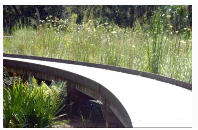
Amy Nichols also visited Bok Tower Gardens in Lake Wales, FL.

Do you have photos taken when you visited another public garden through the AHS Reciprocal Membership Program? We'd like to feature your pictures in a future news journal or possibly a travelogue program! Please send your photos to pat.drackett@msstate.edu.