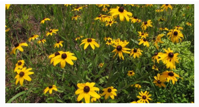
Transplanting (with permission, of course) from existing, at risk wild populations such as this patch of Rudbeckia in the ditch at Hillside Bog Natural area, preserves local biodiversity.

A nativar is a cultivar of a species native to your defined region. For example, a nativar of our local Pecan Tree is Carya illinoinensis cv. Western or Carya illinoinensis 'Western'. Many nativars appear to be suitable to your region but may in fact be adapted to other areas of the country and may not perform as they should in your region. Although nativars may sound like a good choice for your sustainable habitat, in fact, they may cause problems for many of the animal pollinators that are dependent on them.