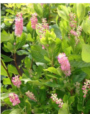
Example: Clethera alnifolia (L) is a white-blooming native shrub. 'Ruby Spice' (R) is a pink-flowering C. alnifolia nativar.

Almost nine out of ten of the earth's plants (including many of your favorite fruits and vegetables) are dependent on pollinators to reproduce. Many of the pollinators are specialized and require specific native plants to host their larval stages and to provide them with the pollen and the nectar necessary for their adult stage.