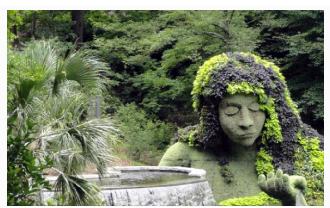
Atlanta Botanical Gardens is an outstanding horticultural destination. Amy Nichols, who took this photo, would agree!

Do you have photos taken when you visited another public garden through the AHS Reciprocal Membership Program? We'd like to feature your pictures in a future news journal or possibly a travelogue program! Please send your photos to pat.drackett@msstate.edu.