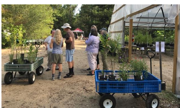
October 5 & 6 (Fri/Sat), 10 a.m. to 3 p.m. Members enter each day at 9:00 a.m.

Grab your cart and choose from an outstanding selection of native plants at this sale that is focused on woody trees and shrubs for your fall planting projects. Knowledgeable staff and volunteers, and Mississippi Master Gardeners will assist you with your plant questions and provide advice on plant selections for your property. Free site admission. Plant sale will be held in Greenhouse area. Use Service Road.