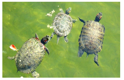
• Feed the fish & turtles in the Piney Woods Pond. FREE fish food for members in the Gift Shop!

• Leashed pets are welcome on the trails and in the gift shop.