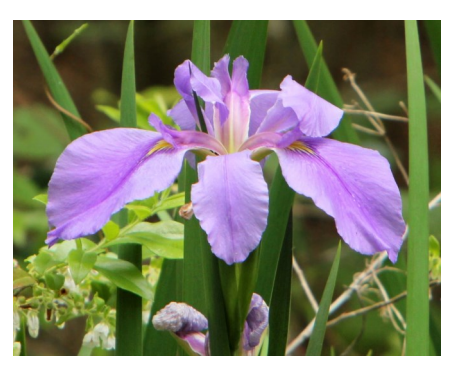
• Attend a program and learn about Mississippi's native plant species, home gardening, or a variety of other subjects.