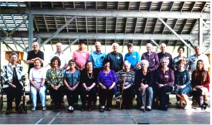
Picayune Memorial H.S. Class of 1954.