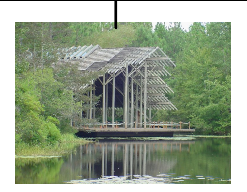
Bring a picnic lunch and enjoy your day at the Arboretum under the Pinecote Pavilion!