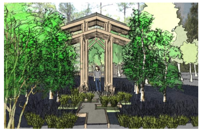
Elevation view of the Rosen Pavilion by Native Habitats, Inc.

Poore and his colleague Rob Anders sited the Rosen Pavilion on the dark, shallow waters of the Gum Pond. It is a simple pavilion that reflects the image of Pinecote Pavilion, but is much smaller in size, just large enough to contain a few benches for seating, creating an intimate space at the water's edge. The Rosen Pavilion is a representation of a black gum dominated hummock, with the pavilion nested in among the trunks. The pavilion columns reach up out of the water, as trees reach for sunlight, forming an understory canopy comprised of beams and a broad thin roof. The pavilion will be accessed by a short bridge winding between the thin grev trunks of the numerous planted black gum trees for which the exhibit is named. Fittingly, placing the pavilion on the water with the bridge passing between the sinuous gum trunks perfectly captures early visions Ed Blake had for the gum pond area.