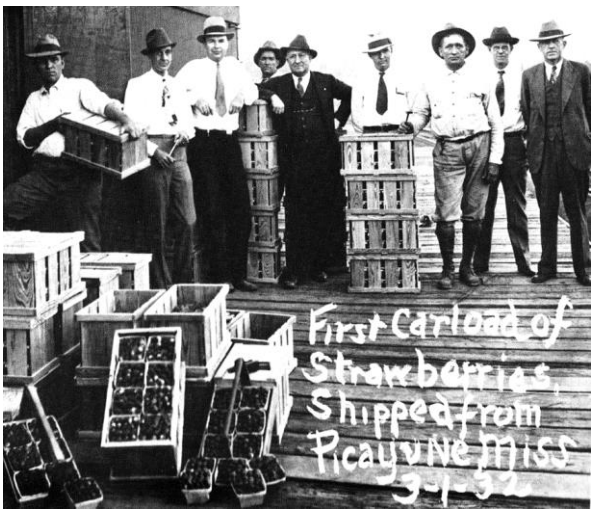
The Crosby Arboretum land was once home to a Depressionera strawberry farm, operated by the Crosby Family.