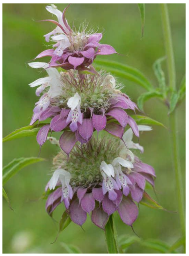
Lemon beebalm (Monarda citriodora).

multiple flower clusters along the same stem in this species. Bracts below the flowers are pinkish to purplish to white, and the flowers are yellow to off-white with purple spots – what a colorful contrast! In my opinion, this species is a great choice to grow in well-drained gardens in coastal Mississippi and elsewhere.