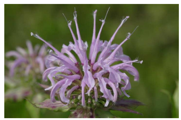
Wild bergamot (Monarda fistulosa)

Horsemint, or spotted beebalm ( Monarda punctata ), like wild bergamot, is a perennial up to about three feet tall. There are