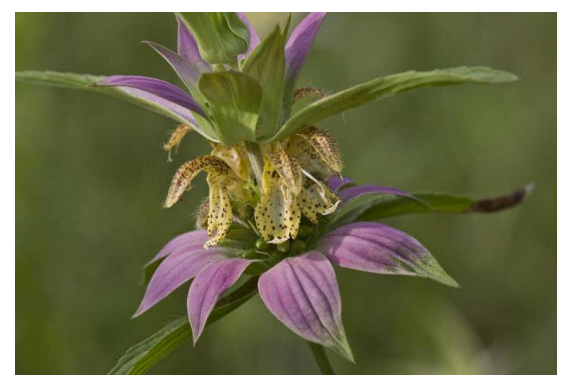
Horsemint, or, spotted beebalm (Monarda punctata)

times, physicians used horsemint ( M. punctata ) as a digestive aid, diuretic, and stimulant, among other applications. Oil from horsemint has a high concentration of the antioxidant and antiseptic thymol (named after the related commercial mint thyme, Thymus vulgaris , native to the Mediterranean region of Europe and the Middle East), and horsemint has been grown in the United States as a source of thymol, especially during World War I. Leaves of the Appalachian Oswego tea ( M. didyma ) have been used to flavor meats. The fragrance of wild bergamot ( M. fistulosa ) has been compared to bergamot orange, and I personally think the smell is reminiscent of oregano ( Origanum vulgare ), another mint native to the area around the Mediterranean Sea. Oil from lemon beebalm ( M. citriodora ) has been employed as a pomade to make hair stay in place and to give hair a smooth and shiny appearance.