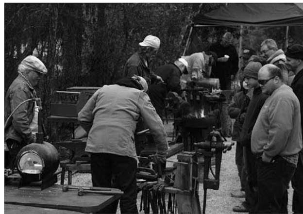
The January weather was chilly, but it didn't stop this dedicated crowd from enjoying Forge Day's second year!