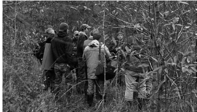
In January, graduate students from MSU Department of Landscape Architecture discussed plans for the site inventory of the Gum Pond Exhibit.